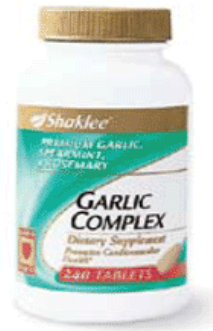
Shaklee's Garlic Complex #20084